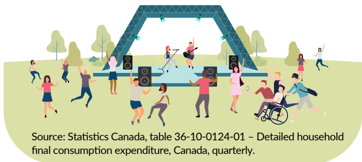
Source: Statistics Canada, table 36-10-0124-01 – Detailed household final consumption expenditure, Canada, quarterly.

In 2022, Canadian households spent over $12.5 billion on recreational and sporting services, a category that includes live sports and recreational events .